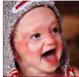
People like you bring "LOVE to the rescue" to kids like Kaj everyday.